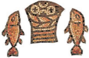
A CHURCH IN THE MAKING