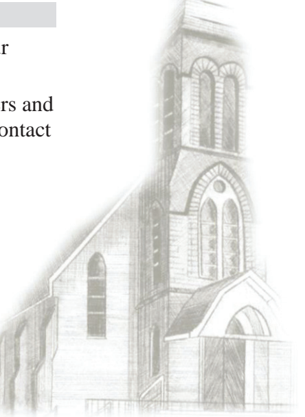
A CATHOLIC COMMUNITY SINCE 1830

Cardinal Ambrozic (2009) 10 Castle Oaks Crossing (905) 913 – 2989