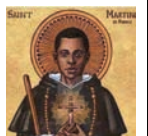
ST. MARTIN DE PORRES

Consider others as more holy and more worthy than you, yet strive to be as holy as you can be.