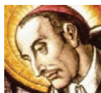
ST. CHARLES BORROMEIO

If we wish to make any progress in the service of God we must begin every day of our life with new eagerness.