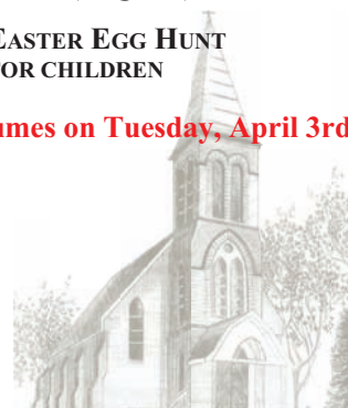
A CATHOLIC COMMUNITY SINCE 1830